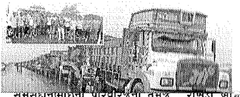
સમુદ્રનાં માંચાં ખારી રેતીનું ખનન કરવા માટે રસ્તો બ્લોક કર્યો...