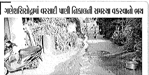
ગોશાસિરોદ્રામાં વરસાદી પાણી નિકાલની સમસ્યા વકરવાનો ભય

ઉમરગામ આનંદ ચેરિટેબલ ટ્રસ્ટ દ્વારા ચક્રવર્તી પરિવારોના સભ્યોનું સન્માન